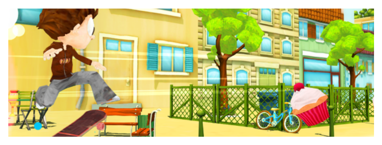
Angelo - Skate Away is a brand new game based on the successful TV show Angelo Rules! Play Angelo, Lola, Sherwood and many more characters in this epic skate game. Enjoy skating through such iconic environments as the City, the School, Adventure Land or the Skate-park, in a fun and easy-toget platformer.

Grind your way through Angelo's world! An epic and challenging skateboard game!